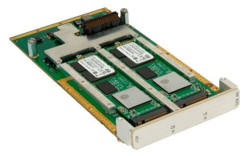
Air-cooled Build Option: 2 x M.2 Devices Fitted