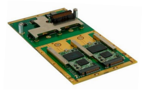
Conduction-cooled Build Option: 2 x M.2 Devices Fitted