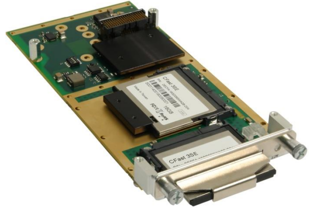
Example: 2 x CFast Cards Fitted