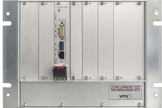
Option Example: Standard Development System (with TR G4C/543 processor board and RTM)